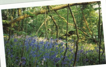
Young sycamore trees make their way towards the light, amid a thick mat of bluebells near Enniskeane.

butterwort and two species of saxifrage. The Strawberry tree ( Arbutus unedo ) also grows here, far from its usual home in the Mediterranean.