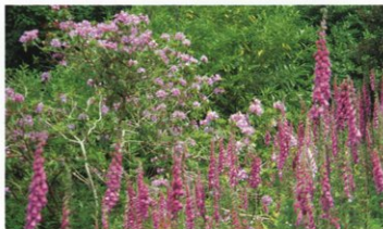
Rhododendron bushes with foxglove at Bantry House.

Hollow trees can shelter bats over winter. The whiskered bat is an endangered species of bat found in West Cork. Bats can help to control insects, some of which are crop pests. A pipistrelle, the smallest, is able to eat over 3000 midges and mosquitoes a night during the summer.