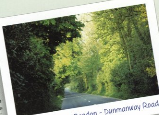
Tree cover on the Bandon - Dunmanway Road.

The Glengarriff Woods were still extensive at the beginning of